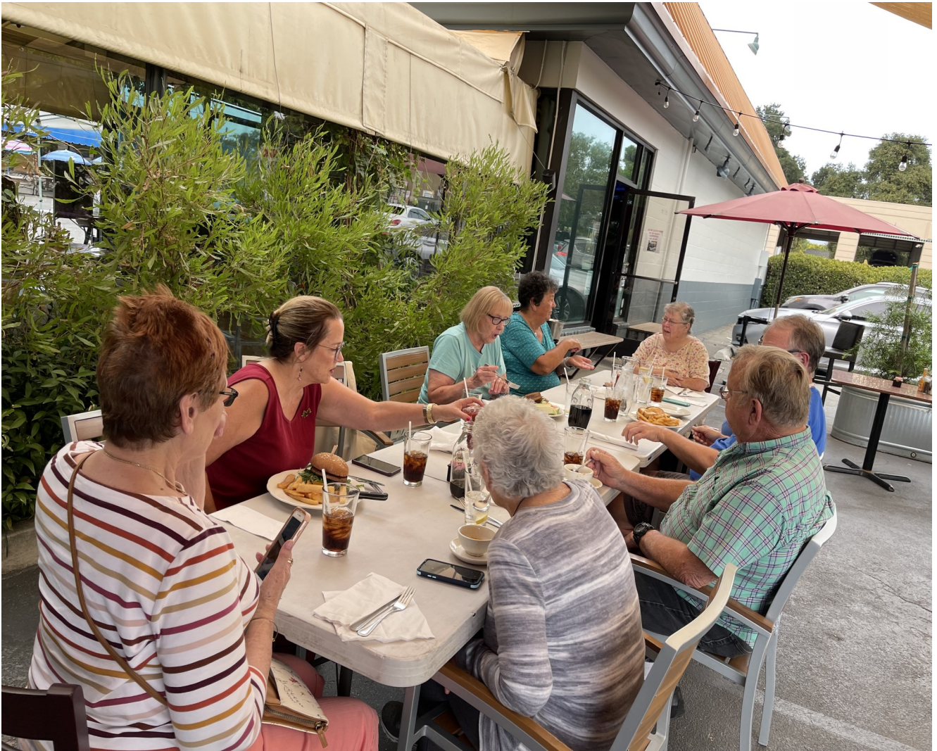
The United Methodist Women enjoying a wonderful lunch after a nice trip to the Museum.